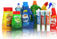
Home Care & Cleaning products