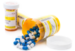
Pharmaceutical products, Body care & Medical Tests

Reduce the complexity, avoid obsolete labels, save time and money.