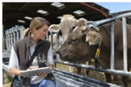
Animal Care & Veterinary products