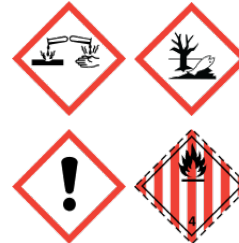
GHS & Chemical products